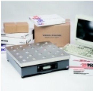
▲ Shown with optional ball-top weigh platter.