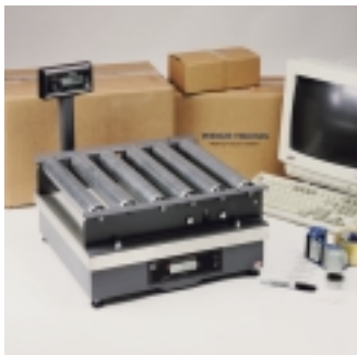
▲ Shown with optional remote display and roller conveyor top.